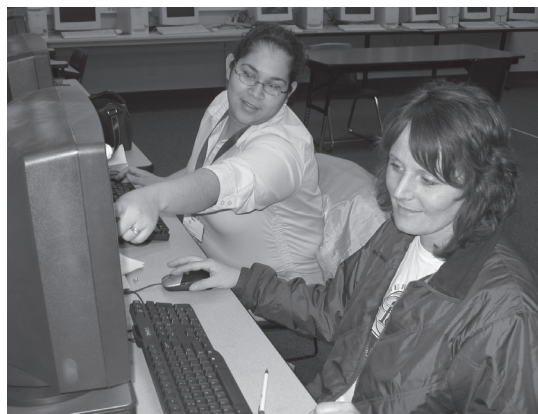
Two students help each other with Mindquest, an online college preparation course.

Students develop a one-to-one relationship with a state certified MQA teacher, who supports them in every step of the learning process through e-mail and regularly scheduled meetings. Students study online at ACE and at home, e-mailing in assignments.